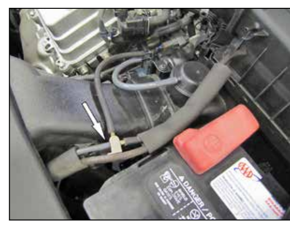
6. Disconnect the vacuum lines from the vacuum switch and the "TEE" fitting shown.