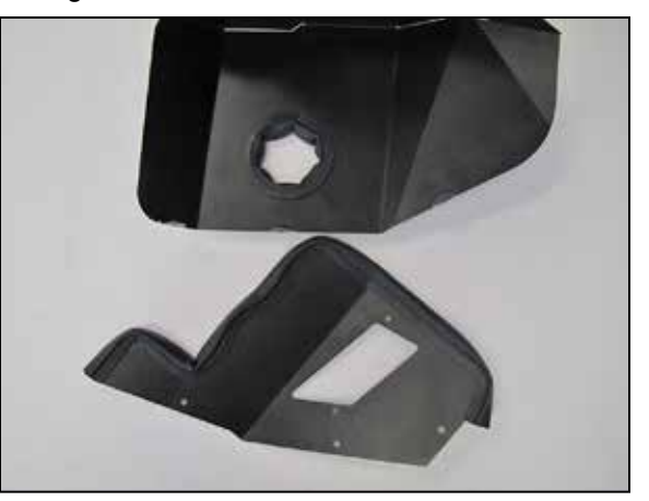
11. Install the provided edge trim onto the heat shield and lid as shown.