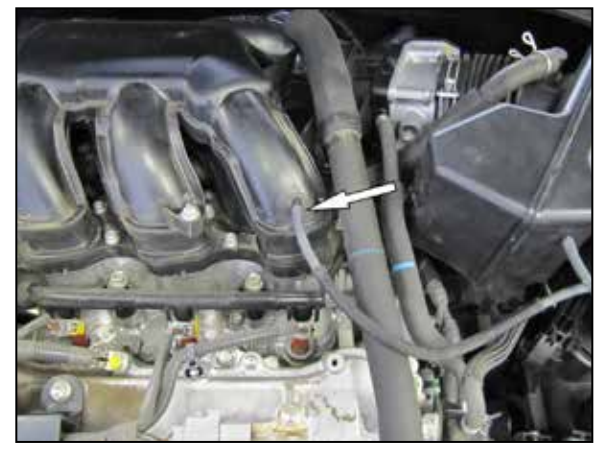
4. Disconnect the vacuum hose from the intake plenum.