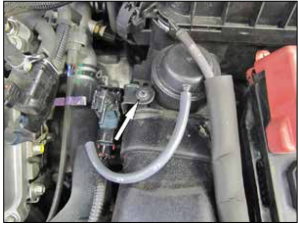
7. Remove the vacuum switch and set aside for later use.