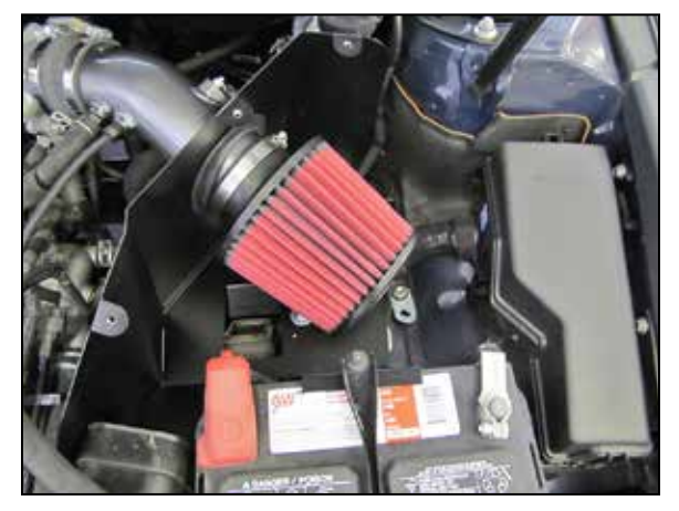
22. Install the AEM<sup>®</sup> air filter onto the intake tube and secure with the provided hose clamp.