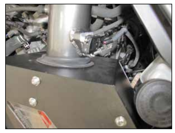
24. Reconnect the mass air sensor electrical connection.