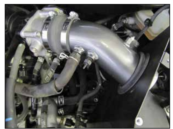
17. Install the AEM<sup>®</sup> intake tube through the heat shield and into the coupler at the throttle body and

16. Remove the mass air sensor from the factory housing and install it into the AEM<sup>®</sup> intake tube and secure with the provided hardware.