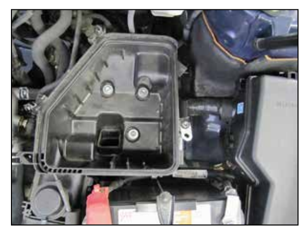
9. Remove the three bolts that secure the lower air filter housing and then remove the housing from the vehicle.

NOTE: AEM recommends that customers do not discard factory air intake.