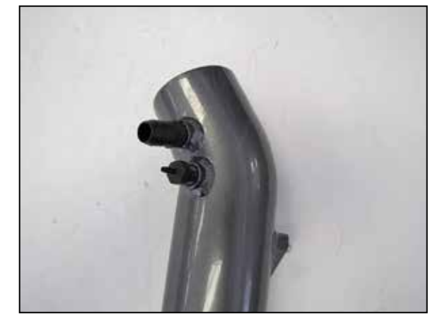
15. Install the provided vent fittings into the AEM<sup>®</sup> intake tube as shown.

NOTE: NPT fitting has tapered threads and only designed to be installed until hand tight, then tighten one rotation or when the fitting becomes difficult to return.