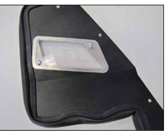
12. Install the AEM<sup>®</sup> window into the heat shield lid using the provided hardware.