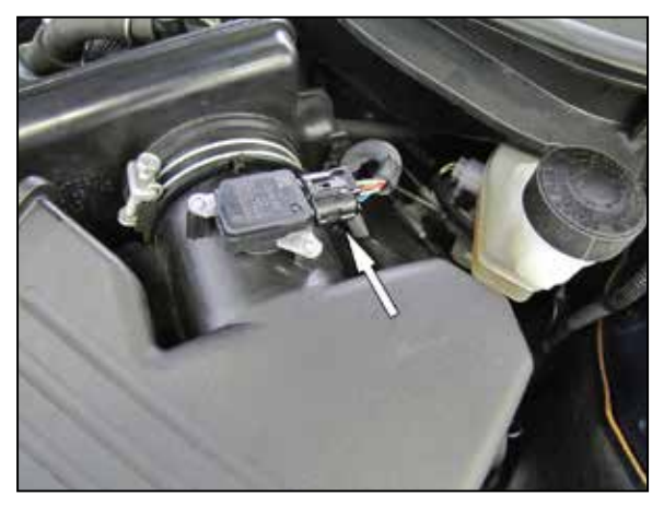
3. Disconnect the mass air sensor electrical connection.