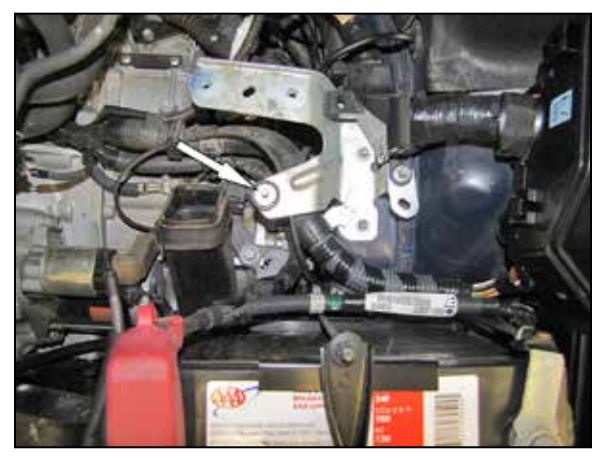
10. Install the rubber mounted stud onto the filter housing bracket where shown.

NOTE: AEM recommends that customers do not discard factory air intake.