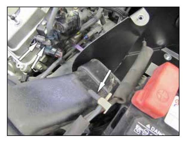
19. Install two of the provided vacuum plugs onto the vacuum switch as shown. Install the remaining vacuum plug onto the factory "TEE" fitting as shown.