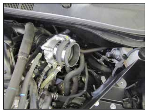
14. Install the provided coupler (087121) onto the throttle body and secure with the provided hose clamp.