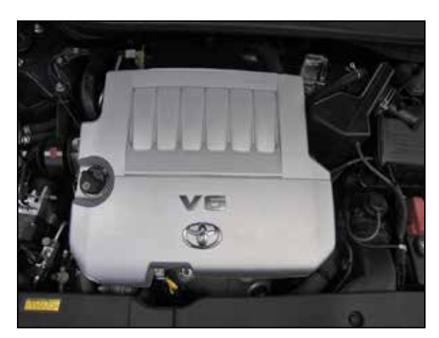
2. Lift off and remove the decorative engine cover.

NOTE: Disconnecting the negative battery cable erases pre-programmed electronic memories. Write down all memory settings before disconnecting the negative battery cable. Some radios will require an anti-theft code to be entered after the battery is reconnected. The anti-theft code is typically supplied with your owner's manual. In the event your vehicles anti-theft code cannot be recovered, contact an authorized dealership to obtain your vehicles anti-theft code.