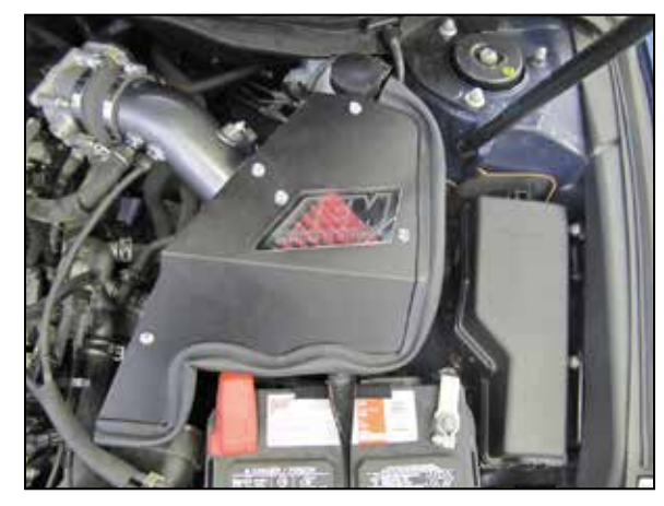
23. Install the heat shield lid and secure with the provided hardware.