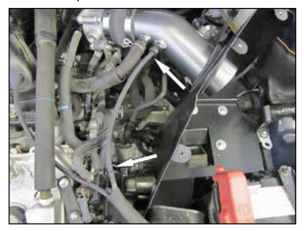
21. Connect the provided vacuum line to the open factory vacuum line and then to the AEM<sup>®</sup> intake tube.