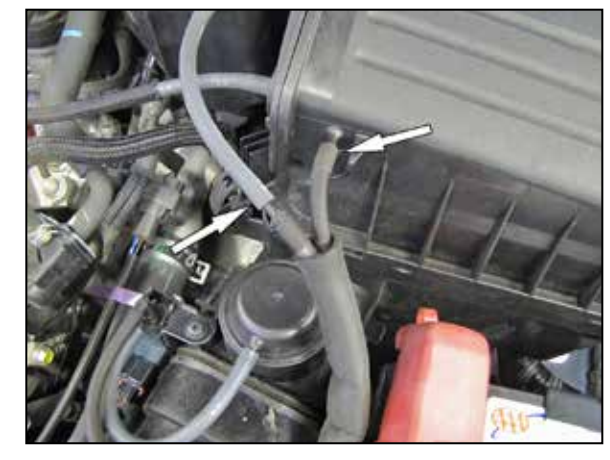
5. Disconnect the vacuum hose from the upper air filter housing and the other hose from the union shown.